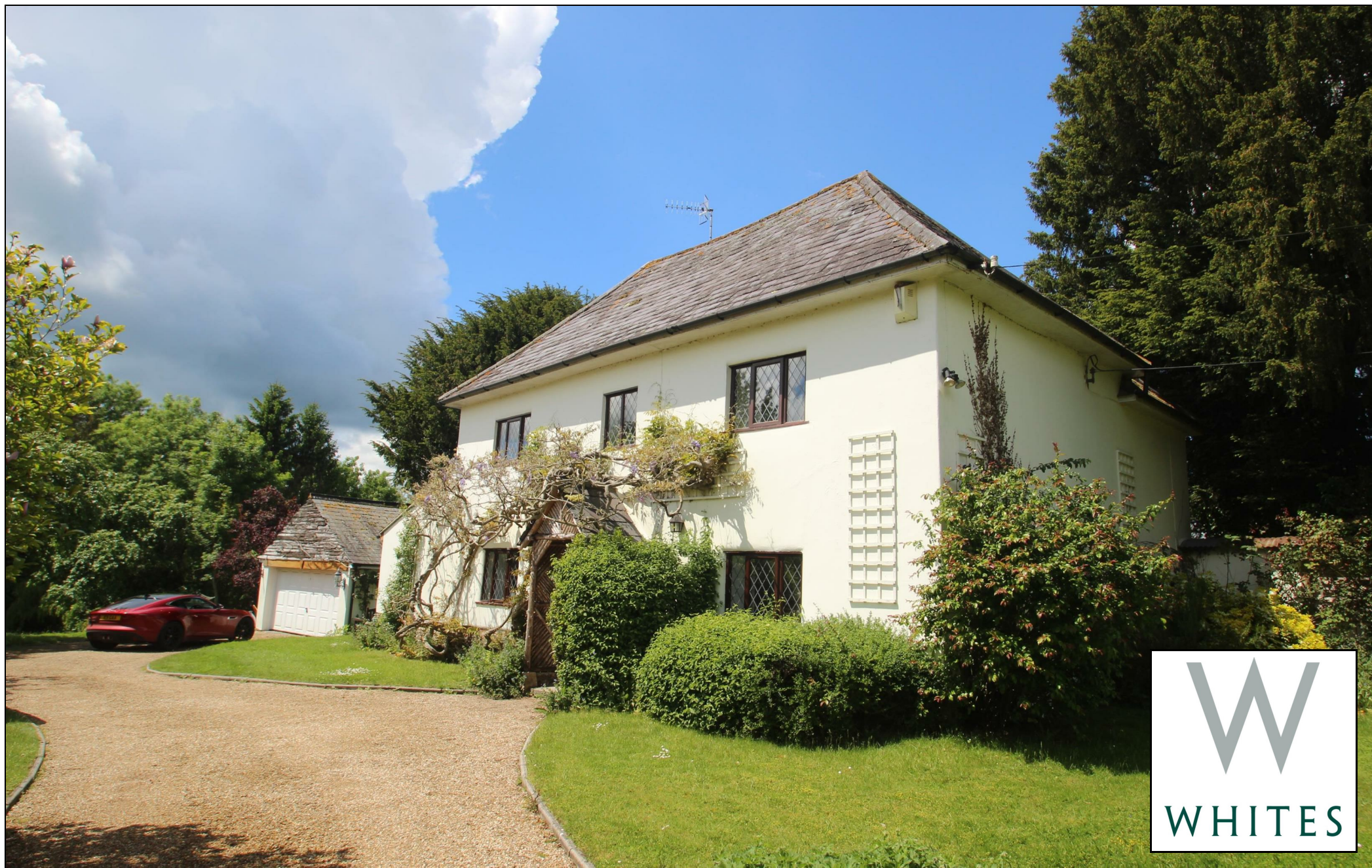
Primrose Cottage, Netton, Salisbury, Wiltshire, SP4 6AW